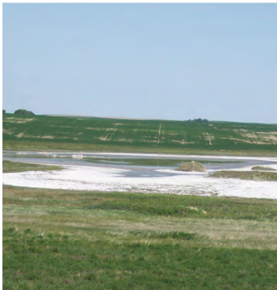
Saline seeps are all too common a site across the Northern Plains and Canadian Prairies. Just in the state of Montana it is estimated 300,000 cropland acres have been lost to salinity.

Weed seed banks in the top two inches of the soil profile need to be dealt with (particularly foxtail barley) or the weeds may overwhelm the new seedlings in the spring. Disking to a depth of 4-5 inches before freeze-up, followed by a leveling packing operation, is usually successful.