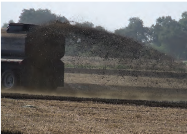
A high producing dairy cow can produce up to four pounds of salt per day in its manure or nearly 1,400 pounds annually to be applied as manure to cropland.

The addition of soil additives such as lime or gypsum can improve the soil structure which facilitates the leaching of the salts out of the soil profile. Depending on the soil pH, two basic methods are generally used. Gypsum helps reclaim “sodic soils” and “saline sodic soils” because it still adds calcium when applied to high pH soils. Another method to correct the sodium problem is the use of elemental sulfur which lowers the pH as a means of freeing up calcium (lime must be available in soil). Adding organic matter to the soil can improve soil structure and aid in leaching the salts. However, it must be noted that manure does contain some level of salt and excessive applications of manure may increase the salinity load in the soil.