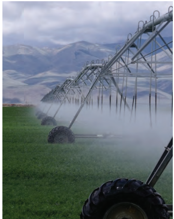
Center pivots are an efficient way to irrigate large acreages of alfalfa. This efficient use of available water and saline water requires regular monitoring to manage potential salinity induced yield losses.

In recent years there has been less and less water available for crop production, and as a result farmers have installed sprinkler systems to conserve water. These systems provide the producer with more efficient water control and use less water compared to flood irrigation. However leaf burn may be more prevalent using sprinklers, especially if the water is high in salts. Nighttime watering may be beneficial in these cases since salt leaf burn is more prevalent in intense heat and sunlight. Sprinkler irrigation applies less total seasonal water than flood irrigation, and as a result it provides less leaching of the soil salts from the root zone. In these systems monitoring at various depths in the soil profile is critical. If soil salts are nearing high levels in the root zone it may be advisable to periodically leach salts from the root zone with a heavy irrigation.