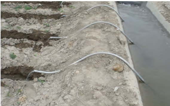
Flood irrigation using canals, ditches, and siphon tubes has been a practical irrigation method since ancient times and is still used in many key alfalfa production regions today.

Irrigated farms using row or flood irrigation generally first see salt problems at the bottom of the field furthest from irrigation source. To minimize the effect of the water that accumulates at the low end of the field (tail water) that is high in salts, surplus water should be drained off and/or reused if possible on more saline tolerant crops.