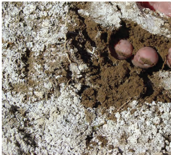
Sodium sulfate, magnesium sulfate, calcium sulfate, and sodium chloride are the most common soluble salts found in saline soils across North America. Sulfate based salts are more often associated with saline seeps.

Conventional and no-till drills, air flow seeders, and broadcast spreaders have all been successfully used for dormant plantings. Any excessive plant material from previous crops should be mowed or grazed down to a level 2 inches or tilled to allow optimal seed placement. Broadcast seedings can occur on top of snow (< 5 inches) as long as the seed bed under the snow will still allow adequate seed-to-soil contact once the snow melts in the spring. Some producers have successfully used livestock trampling to incorporate broadcast seedings. If this method is used to incorporate the seed, livestock should be removed in the spring once germination has occurred.