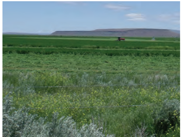
Improved non-dormant alfalfa varieties with salinity tolerance offer alfalfa growers in the southwestern U.S. and Mexico added yield potential.

In addition to federal programs, numerous state and local organizations exist such as soil conservation districts that can provide expertise and assistance in managing saline soils. One prime example is the Montana Salinity Control Association (MSCA), a satellite organization of Montana’s Conservation Districts. MSCA provides producers with technical assistance in the reclamation and control of saline seeps in agricultural areas. Their program highlights the use of perennial deep-rooted forages such as alfalfa in non-saline recharge areas and the use of salt-tolerant forages in saline areas to control/reclaim cropland losses due to saline seeps. Saline tolerant forage is planted closer to the saline seep when the conditions are favorable, which may be at the same time as the alfalfa but often delayed until saline conditions improve as the water table is lowered.