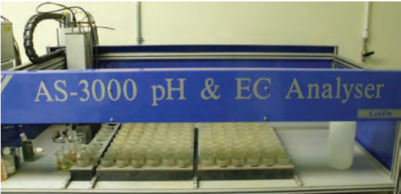
Soil testing labs like Western Soil Testing Labs in Parma, Idaho, have specialized equipment to measure salinity and other soil components.