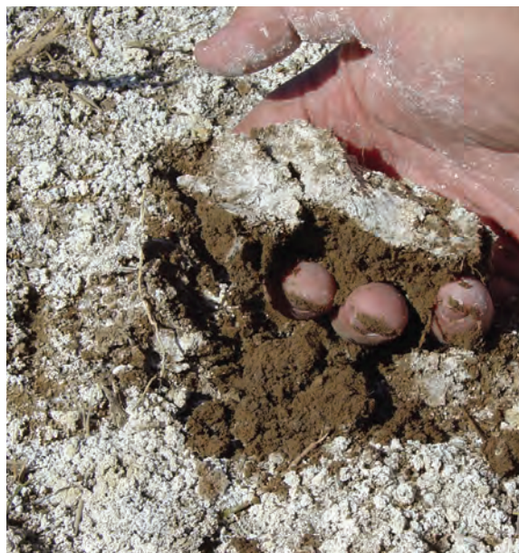
Saline "White Alkali" is the most common type of saline soil found in North America and in most cases can be managed for alfalfa production.

The words saline, alkaline, and alkali are often mistakenly used interchangeably by producers when they discuss marginal soils. Saline is a soil in which soluble salts interfere with plant growth, and alkaline describes soils with a pH above 7. An alkali soil is one in which the exchangeable sodium level is high enough to interfere